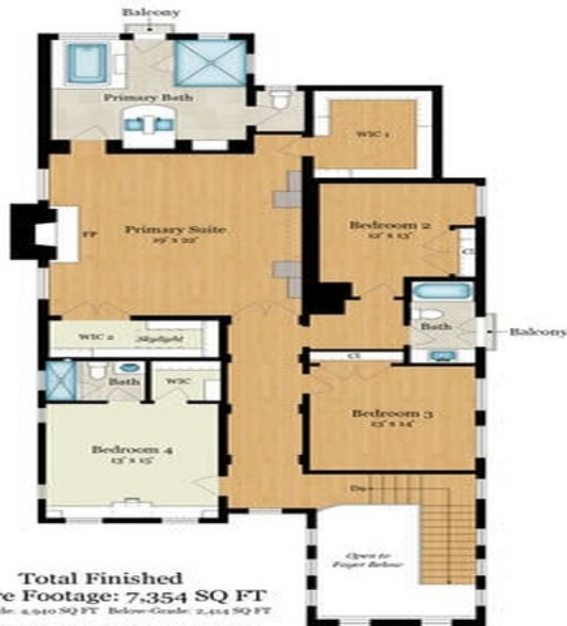
MAIN RESIDENCE UPPER LEVEL 2,060 SQ FT

Total Finished Square Footage: 7,354 SQ FT Above-Grade: 4,940 SQ FT Below-Grade: 2,414 SQ FT