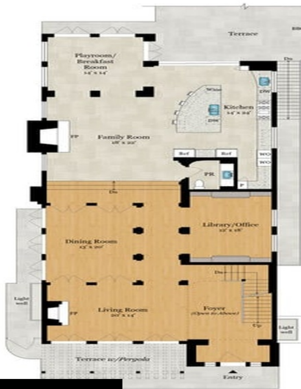
MAIN RESIDENCE MAIN LEVEL 2,621 SQ FT